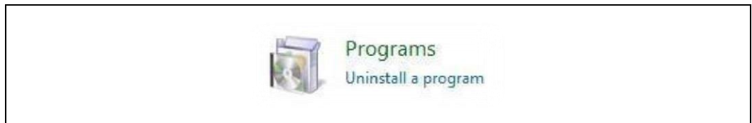
Figure 2. Uninstall a program